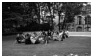
Graduate students at the Cité Internationale